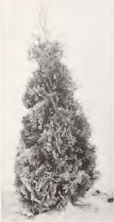
PYRAMIDAL ARBOR VITAE

JAPANESE YEW. T. cuspidata . Hardy, like the above, but of more spreading habit. 12 to 15 in. $3.00 each; 15 to 18 in. $4.00 each.